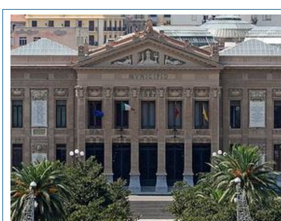
Messina Town Hall

The objective of CERTuS is to stimulate the growth of the energy service sector and to help stakeholders to gain confidence in such investments.