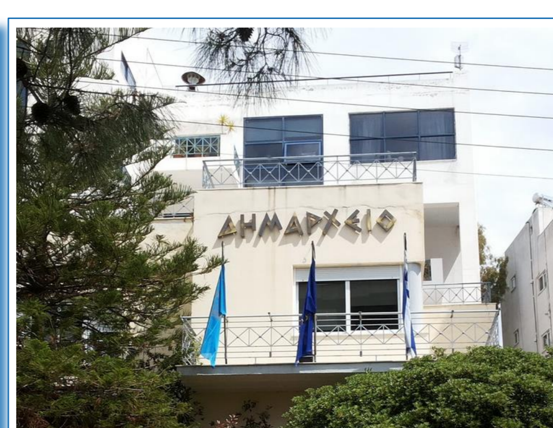
Alimos Town Hall