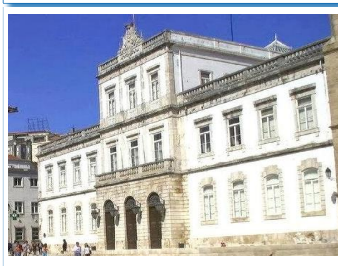
Coimbra Town Hall